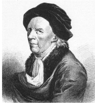
Leonhard Euler, 1707-1783

Sixteen golfers are going to meet the next five Saturdays to play rounds of 18 holes. They will always golf in groups of four people each. How should the sixteen golfers arrange themselves so that each golfer plays with every other golfer?